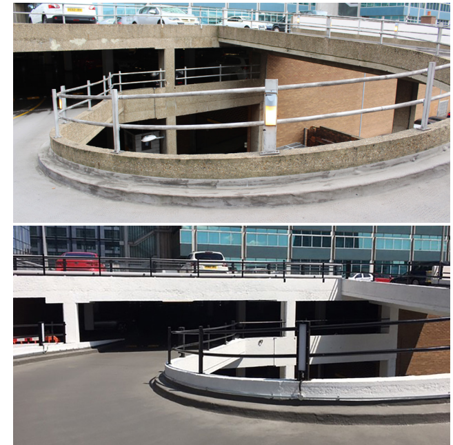
After: Protective Coating

the existing lighting system also. The impact barriers (edge protection) were also upgraded using the A-Safe Barrier system as part of our contract.