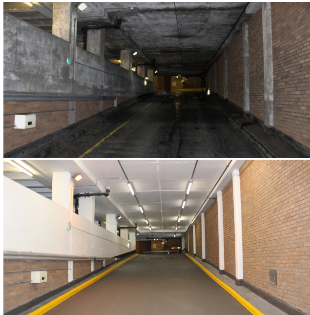
After: Re-waterproofing Access Ramps

The scope of this car park refurbishment was to repair & re-waterproof existing damaged asphalt waterproofing applied to both the top (exterior) and intermediate levels including the main access ramps between levels.