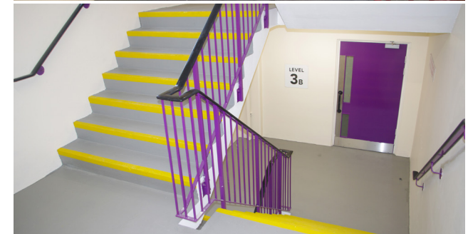
After: Stairwell Refurbishment

rather than having to remove and replace the existing damaged asphalt layer. The stairwells were completely refurbished along with the external façade metalwork and signage was upgraded throughout.