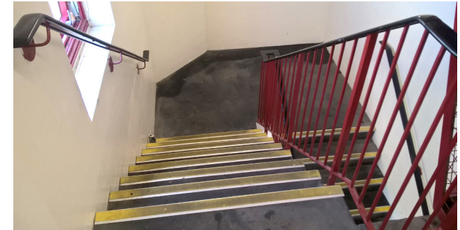
Before: Stairwell Refurbishment

The existing asphalt rooftop deck - 1,800m 2 - was re-waterproofed using Sika's rapid-curing Sikafloor Pronto system applied directly onto the existing asphalt layer being a much more cost effective and practical solution