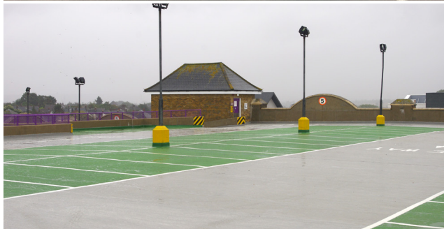
After: Deck Waterproofing and Linemarking