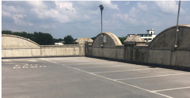
Before: Deck Waterproofing and Linemarking

Client | Chemsford City Council Role | Principal Contractor Consultant | J P Chick & Partners