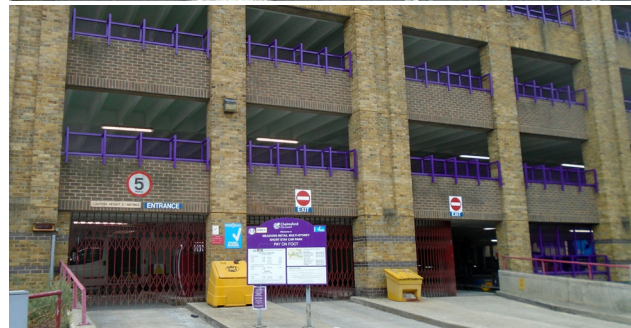
After: External Decoration and New Signage

15,000m 2 of concrete soffits, columns & beams internally making a dramatic difference to the car park's internal appearance.