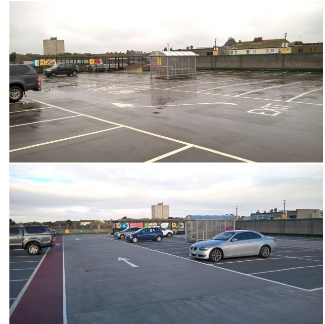
After: Concrete Repairs

Sika's fully-reinforced Pronto 32 system was applied to all areas including up / down ramps. Cemplas also carried out localised concrete repairs to the semi-circular vehicular access ramp.