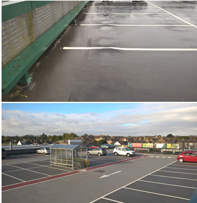
After: Asphalt Waterproofing

The car park at Morrisons Herne Bay is located on the roof of the retail store itself and is split over two levels providing approximately 80 spaces.