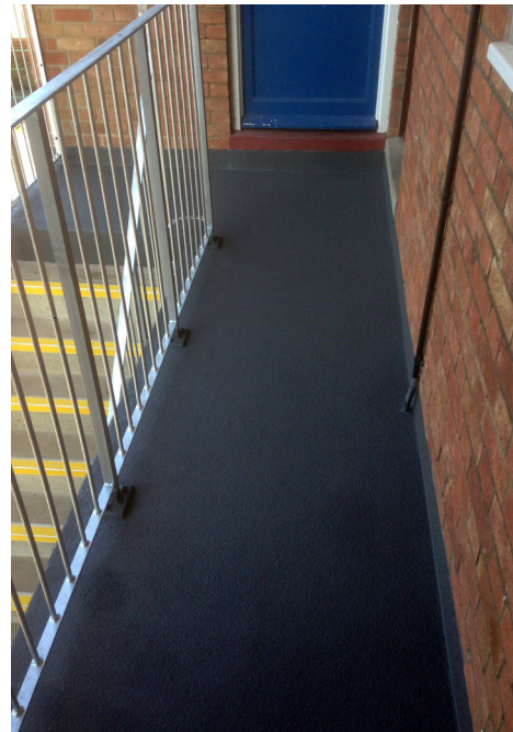
Waterproof and Slip-Resistant Surfacing