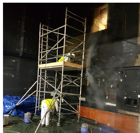
Before: Repair Works

To view the previous case studies of specialist works undertaken by Cemplas, please visit www.cemplas.co.uk