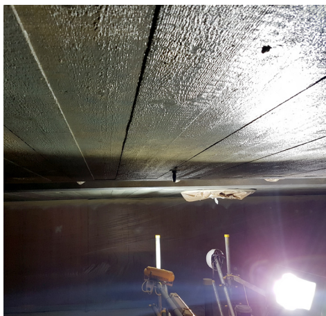
Remmers' Arte Mundit 'Peelable' Poultice