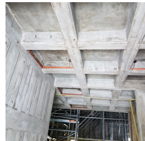
Hayward Gallery Cleaned