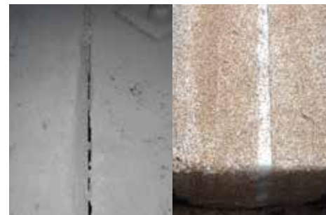
Hypalon strip over movement joints