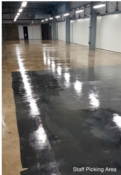
Staff Picking Area

Client | BAM Construction Role | Specialist Sub-contractor