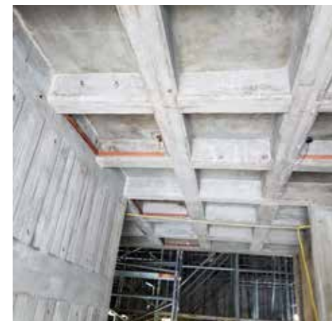
Hayward Gallery Cleaned

Est. 1969 cemplas // REPAIR // PROTECT // TRANSFORM