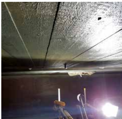
Remmers' Arte Mundit 'Peelable' Poultice