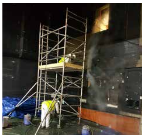
Before: Repair Works

To view the previous case studies of specialist works undertaken by Cemplas, please visit www.cemplas.co.uk