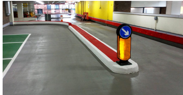
After: Light & Bright Interior Improvements

repairs to approx.. 120m 2 of the exposed substrate, Sika's partially reinforced RB28 deck waterproofing system was applied throughout in contrasting colours. In doing so, it allowed a for a pedestrian walkway to be created for the users of the car park. All line marking and instructions were also replaced.