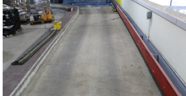
Before: Damaged and dark interiors

Some 4,500m 2 of parking deck - over 3 levels - were prepared by captive shot blast to remove existing coatings and to enable concrete repairs to be carried out. Following