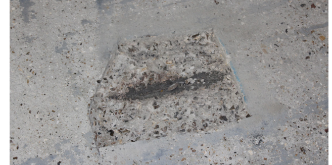
Before: Corroding decks

Our package of works included the installation of corrosion control measures including the applying anti-carbonation