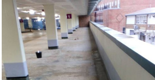
Before: Failed decking

Client | Bracknell Forest Council Role | Principal Contractor