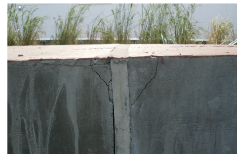
Concrete Planter Damage