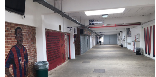
Before: Unprotected Concrete

The concrete substrate was mechanically prepared to including some substrate removal to an external area. Approx some 50m 2 of the concrete substrate had to be repaired prior to the application of the Mastertop 1324 system that the client had chosen to match with the clubs colours.