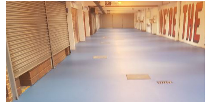
After: Light & Bright Interior Improvements

The result: The concourse area was transformed from a dark and uninviting bright, safe and colourful environment.