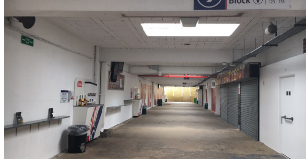
Before: Substrate Damage

Following a competitive tender process Cemplas were appointed as Principal Contractor to carry out the flooring works with the system selected meeting aesthetic, durability and slip resistance requirements. Externely tight timescales