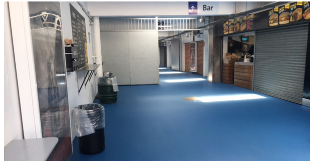
After: Enhanced Environment

were a factor given that the works needed to be completed for the first home game of the season.