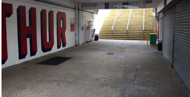
Before: Dark & Unwelcoming Environment

Client | Crystal Palace Football Club Role | Principal Contractor