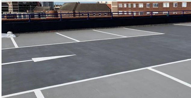
After: Deck Waterproofing Replaced

The scope of this refurbishment was to carry out concrete repairs and re-waterproof the parking decks throughout the two-storey parking structure situated over a shopping centre.