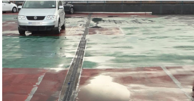
Before: Drainage Issues

The waterproofing to both decks were removed back to the structural topping which was repaired with a concrete repair system once exposed. The expansion joints were overhauled and the entire upper deck drainage was