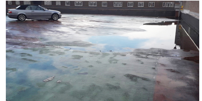
Before: Ponding Issues

The intermediate level directly above the retail units themselves had an existing asphalt surface, required repairs and re-waterproofing to prevent water ingress.