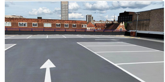
After: Ponding and Drainage Issues Resolved

Concrete repairs were carried out to the exposed internal RC frame and anti-carbonation coatings applied to protect and extend the life of the structure.