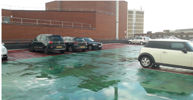
Before: Existing Waterproofing Beyond Service Life

Client | Seddon Construction Role | Specialist Sub-Contractor