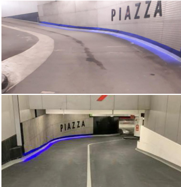
After: Light & Bright Welcome to Car Park

Cemplas were appointed as Principal Contractor to transform basement level 2 of the car park. Existing coatings were removed by planing and captive blasting with minor concrete repairs carried out.