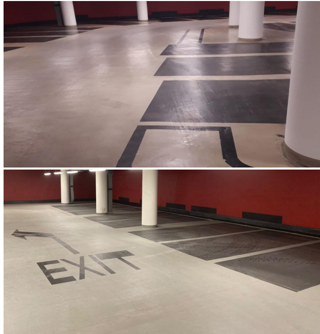
After: Brightened Interior

Tremco's fast curing Deckshield MMS system being applied to optimise programme.