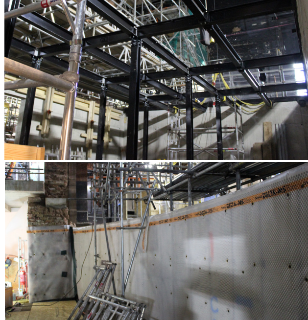
In Progress: Highly Congested Site

budget and an ambitious 15-week programme; there was simply no scope for delays!