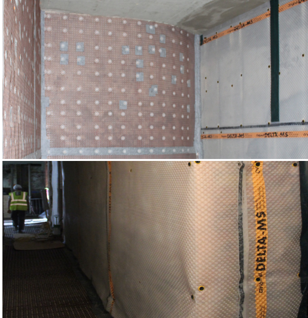
In Progress: Cavity Drainage system to Walls

The scope of this refurbishment was to design and install the below-ground waterproofing works to the illustrious Victoria Palace Theatre in London's West End.