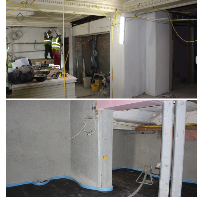
In Progress: Sika 1 Render & Screed

theatre's main boiler room. RIW's Bituthene 4000 was applied to a range of areas to complement the overall waterproofing design.