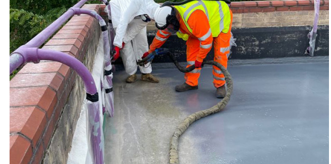
During: Waterproofing to Upstand

With the car park having to remain in constant use during working hours, such restriction meant an increase of contractor traffic continuously throughout the car park