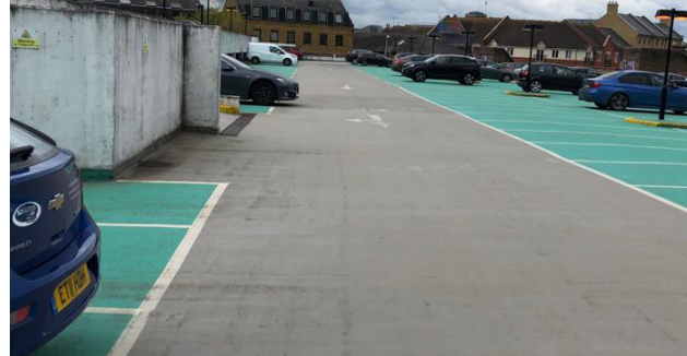
Before: Split & Damaged Decks

Given the structure type and consideration of the maximum possible weight loadings, specialist preparation plant and machinery was used to removed nearly 6,000m 2 of the top deck waterproofing. Due to the local authority having flagged the requirement for the works, only minimal repair