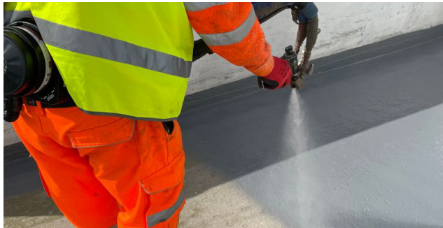
During: Application of Spray Applied Waterproofing

The scope of this refurbishment was to re-waterproof the exposed split-level top deck of this lift-slab structure, which had come to the end of its serviceable life and needed to be replaced.