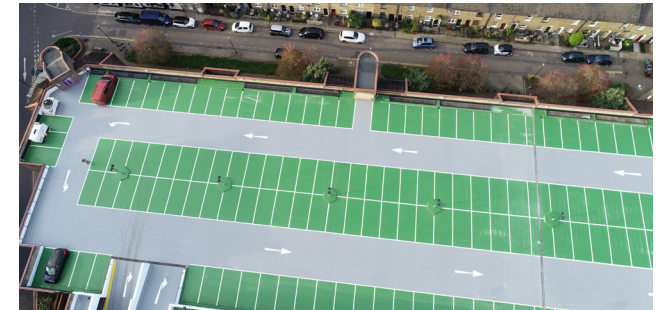
After: Fully Protected Decks

which had to remain in use at all times; continuous traffic management was required to protect both users and workforce alike.