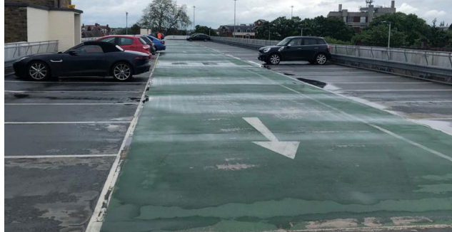
Before: Dark & Unwelcoming Environment

Client | Chelmsford City Council Role | Principal Contractor