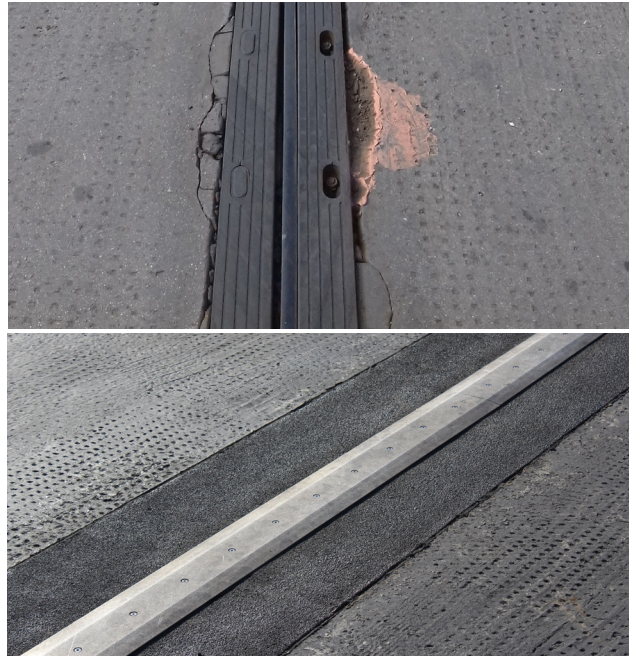
After: Structural Coverplate Movement Joint

supports were reconstructed to ensure the new Emseal SJS coverplate movement joint would be watertight. Once installed, the asphalt and waterproofing system were reinstated.