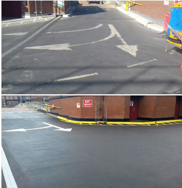
After: Asphalt Re-Waterproofed

The scope of this project was to repair and re-waterproof the damaged (impact by HGV's etc) asphalt and the failed movement joints to the service deck which was allowing water ingress into the shopping centre below.