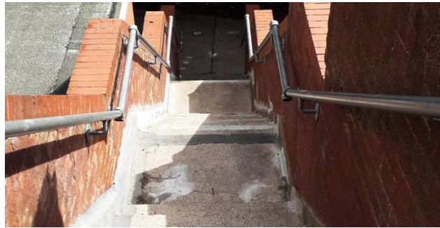
After: Staircase Walls Replaced