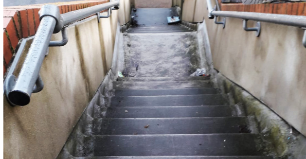
Before: Staircase In Poor State Of Disrepair

E: info@cemplas.co.uk W: www.cemplas.co.uk