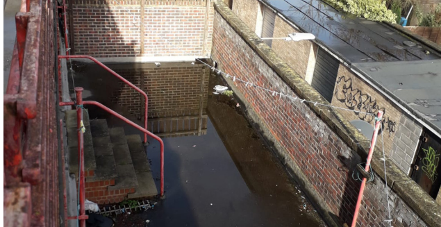
Before: Damaged & Closed-Off Balconies

Client | Corby Borough Council Role | Principal Contractor