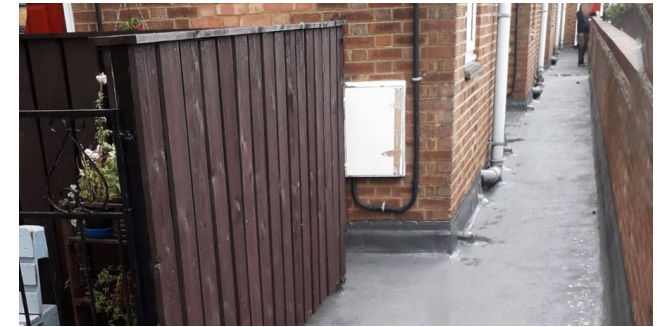
After: Timber Fencing Replaced with New

Included in our package of works was the application of Sika's concrete repair mortars and protective, anti-carbonations coatings to the soffits. A black marine-grade paint was also applied to the steel balustrades for long-term protection.