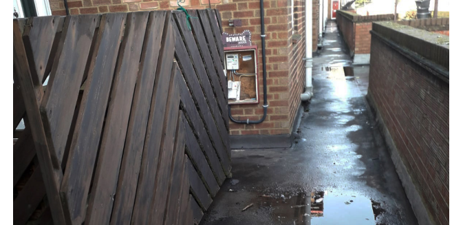
Before: Rotten Timber Fencing

Some 1,000m2 of walkways were waterproofed using Sikalastic Trafficable Rapid system. The staircase walls were also in poor condition and badly damaged due to long-term weathering. The walls were reconstructed and rebuilt within 10 days. Following this, a slip resistant surface was applied to all steps for enhanced safety.