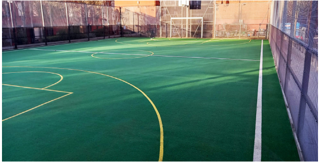
After: Light, Bright & Watertight Sports Surface

was cleaned and fully encapsulated and waterproofed using Sika 1, a cementitious render to extend the life of the structure for many years to come.