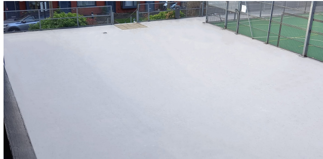
After: Fully Protected Courtyard & Walkways

there would be no more water penetration. A new 'all-weather' sports surface – including Sports Shock Pad and Sports Needlepunch Carpet - was installed with various linemarking for the community to use.