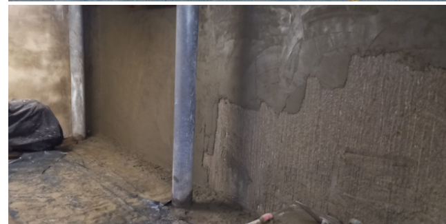
During: Cementitious Render To The Basement Car Park