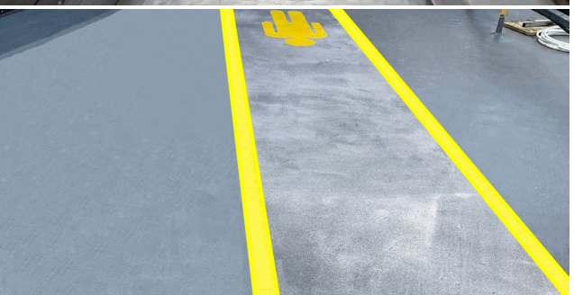
After: Vibrant New Line Markings on Gym Walkway

all cleaned to remove any vegetation and contaminants prior to the application of new materials. Following localised repairs all roof areas were fully re-waterproofed using the Sika Decothane waterproofing system.