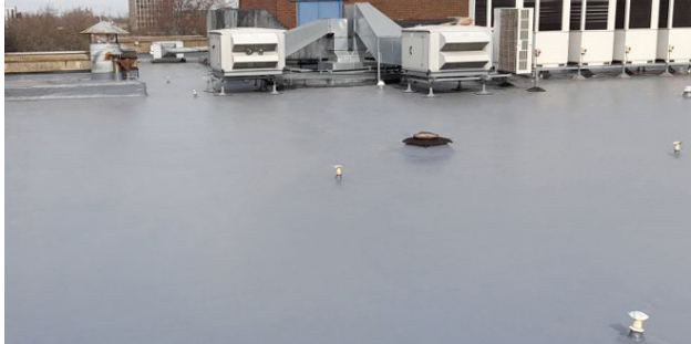
After: Fully Re-Waterproofed Roof Area

ply waterproofing system had failed, allowing water to penetrate beneath it and causing the insulation to become saturated.