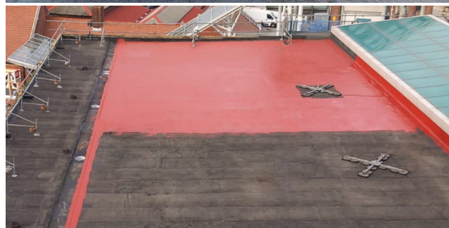
During: Application of Sika Decothane Waterproofing System

The scope of this refurbishment was to carry out localised repairs & re-waterproof four of the roof areas to this shopping centre, measuring in excess of 4,000m<sup>2</sup>.