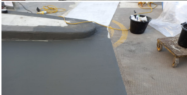
During: The Build Up & Feather Out Of The Height Difference

The scope of this refurbishment was to replace the existing waterproofing system as it was allowing water ingress into the retail units below one of the entrance and exit ramps.