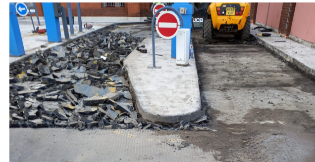
During: Removal Of Asphalt To The Cementitious Structure

A self-levelling mortar was applied to build up and feather out the difference in height between the new waterproofing system and the existing asphalt while still following the existing falls within the cementitious structure.