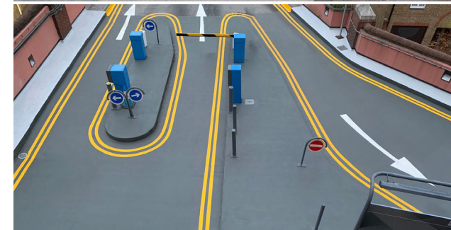
After: Application Of Vibrant New Line Markings

Westwood's Wecryl waterproofing system which has crack-bridging, joint-bridging, trafficable and slip-resistant properties was applied to the entrance and exit ramp and pedestrian walkways of the Oaks Road entrance to this shopping centre ensuring the structure beneath became watertight.