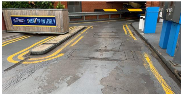
Before: Damage To Existing Waterproofing System & Asphalt

The asphalt underneath the waterproofing system – which had come to the end of its serviceable life – had become displaced from where cars had been parked upon entry, with damage and slumping to the asphalt around the kerbs, leading to the water ingress.