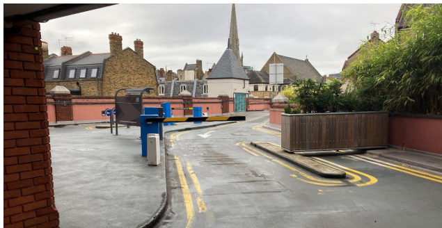
Before: Water Ingress Into Retail Units Below

Client | CBRE Role | Principal Contractor