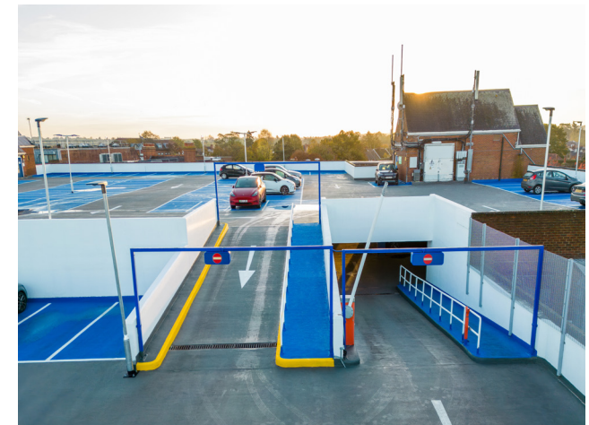
After: Fully Protected Decks & Ramps