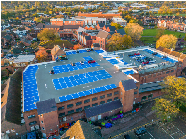
After: Aesthetically Enhanced Top Deck

For further advice and/or information regarding all of our services, please visit www.cemplas.co.uk