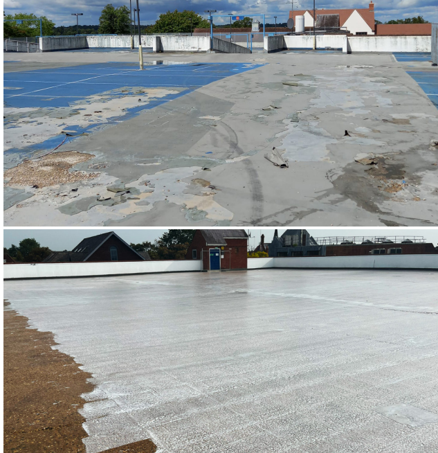
During: Pre-Primer To Combat Outgassing

The Plaza Shopping Centre stands proudly at the heart of Wokingham town centre, serving as a vibrant hub for residents and visitors alike. Beyond parking, this car park serves multifunctional purposes, accommodating town centre visitors, patrons of the shopping centre and members of the renowned Nuffield Health and Wellbeing gym. Additionally, it provides essential support for local residents with permit parking options, ensuring convenience and accessibility for those in the vicinity. This integrated approach not only enhances the overall shopping experience but also fosters a sense of community and inclusivity within the bustling town centre environment.