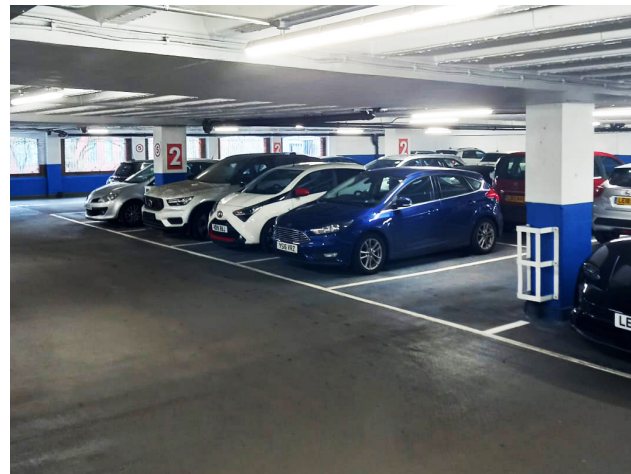
After: Light & Bright Interior Improvements